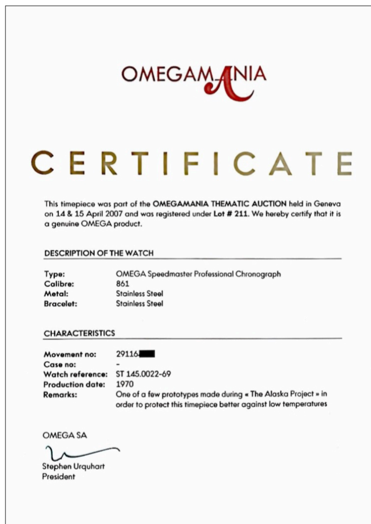
Example of a certificate from the Omegamania auction (2007)

Although the first extracts issued by the brand date back to 2005, their popularity probably really took off with the Omegamania thematic auction sale organised jointly by Omega and Antiquorum in 2007. The watches sold at this auction were accompanied by a document signed by the President of Omega.